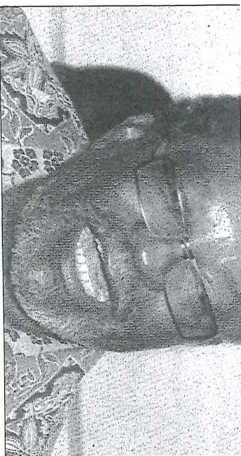
The Deputy Prime Minister, Marco Hausiku

including Marco Hausiku the Deputy Prime Minister, John Mutorwa, the Minister of Agriculture, Water and Forestry, Ro-